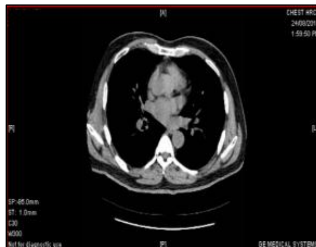
Fig. 2: Showing resolution of the chest wall abscess after treatment